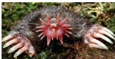
World's weirdest animals