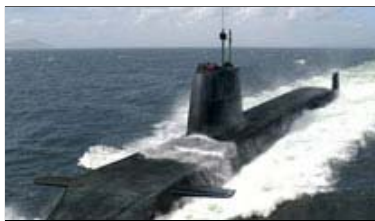
British nuclear submarine of new generation