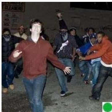
Run White Boy, Run!

practitioner and instructor in Northwest Arkansas encourages her students to bring their entire being "to the mat," assuring them that more will be revealed if they are patient and willing to fully engage in the practice - not a whole lot to ask for such life changing benefits, informs Food Consumer .