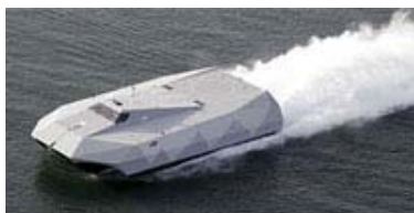
Stiletto stealth Ship